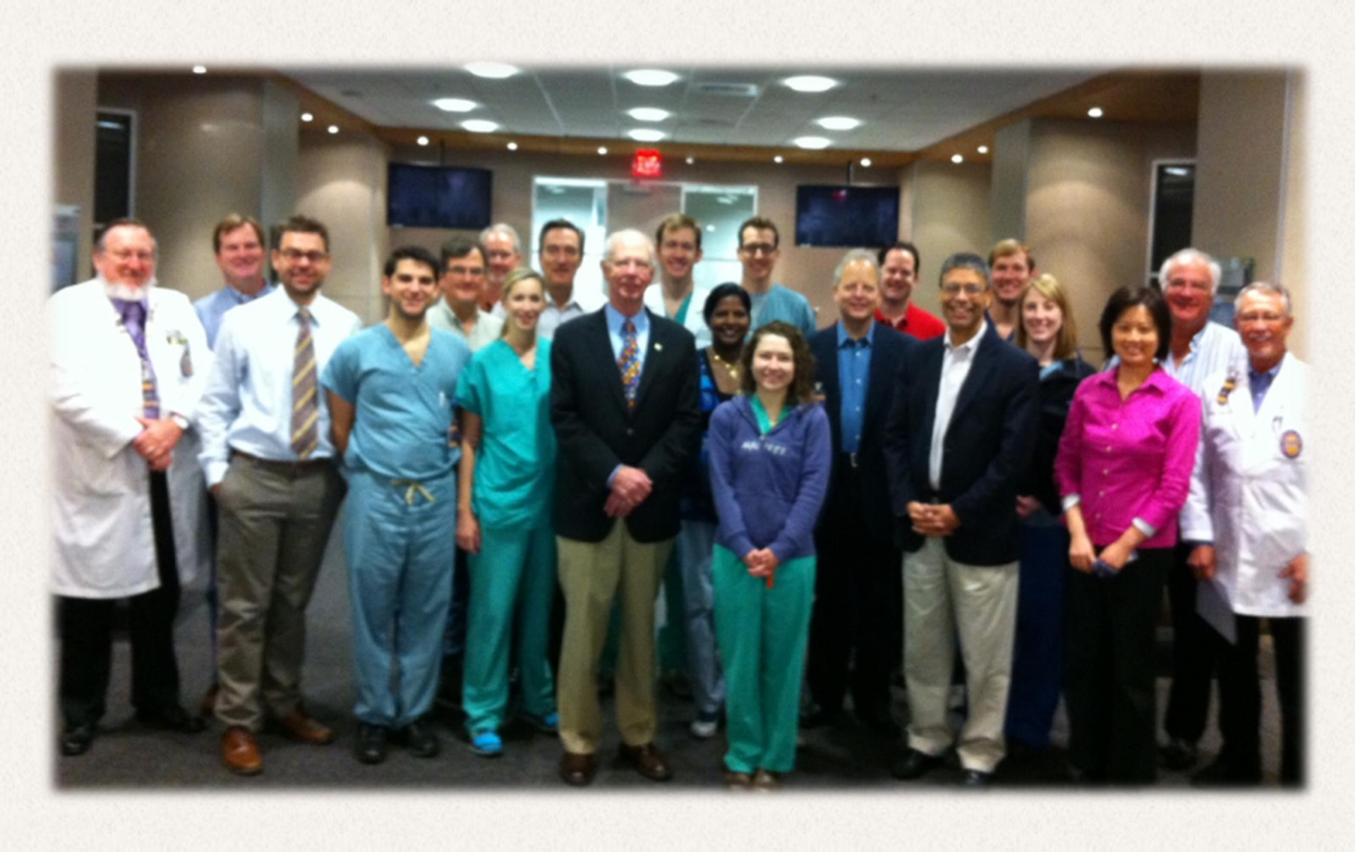
Three Annual Temporal Bone Courses with National Faculty