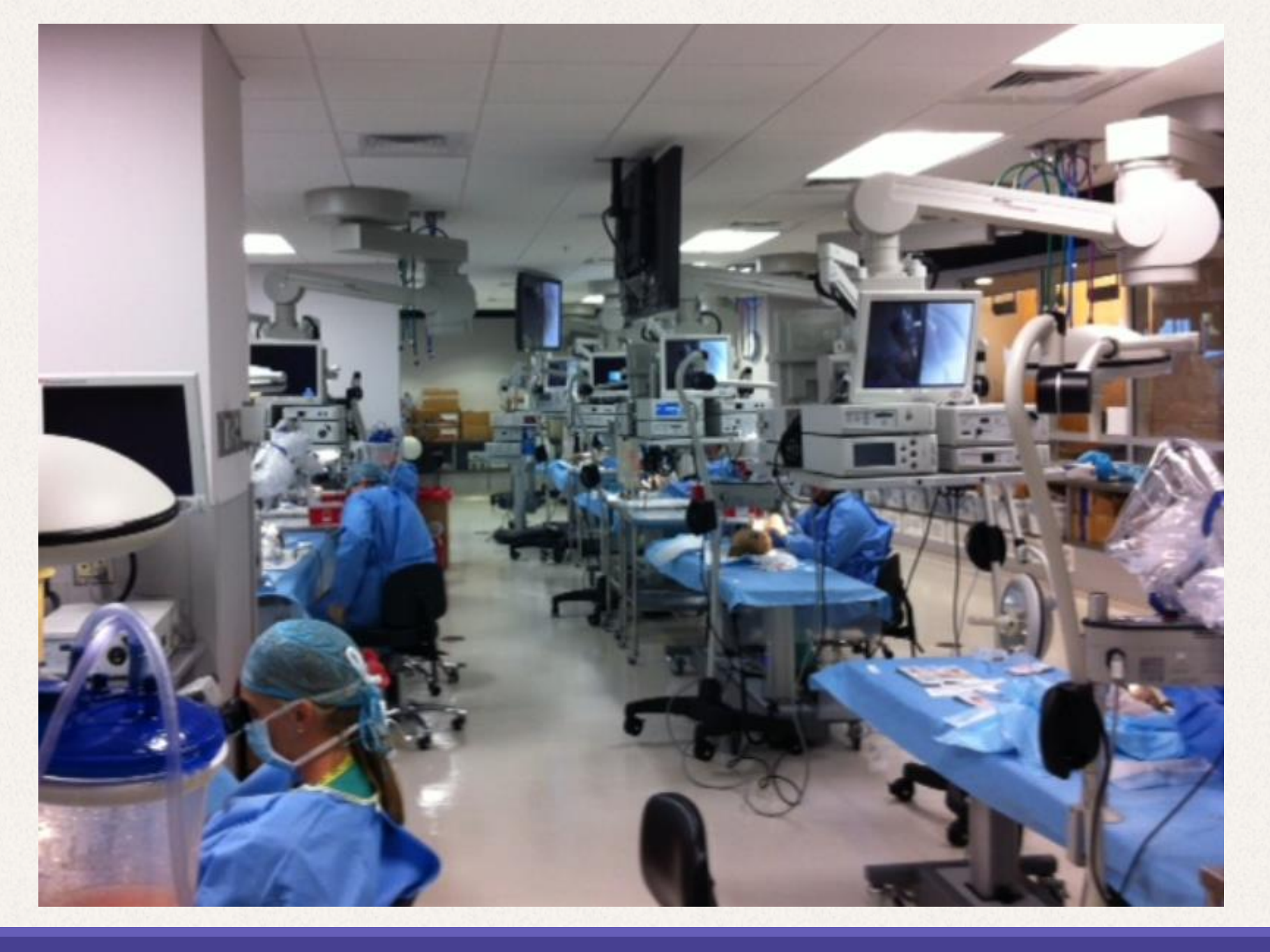
LSU Temporal Bone Dissection Course – December 7-8, 2012